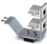
Patch field with two RJ45 CAT5e network connections

Patch panels - FL PF 2TX CAT5E - 2891165