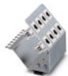
Patch field with eight RJ45 CAT5e network connections

Patch panels - FL PF 8TX CAT5E - 2891178